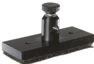
ACCX Clamp - For ACCX & ACCX-W accordion microphones

Bass Clarinet Clamp - Used with BCS system.