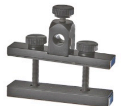
P43S Clamp Harp microphone