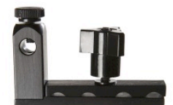
ERTS Clamp Djembe & Perc. microphone