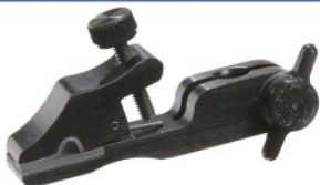
AMT Clamp - For flanged bell instrumnets

Clarinet Clamp - Optional LS and P808 clamp used as a 2nd choice recommendation / double on clarinet, alto and bass flutes. Clamp included with the Z1L for alto and bass flutes.